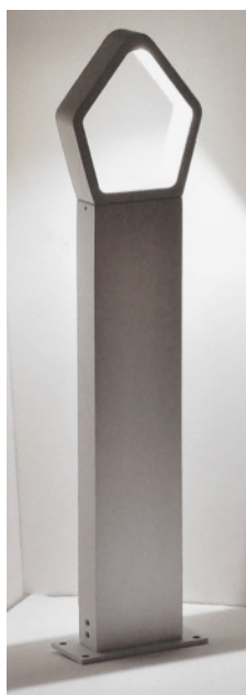
LWC 009-600 130 x 35 x 600 COB 1 x 7W