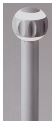
LWC 036Y-600 Ø100 x 600 LED 2 x 5W