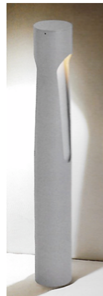
LWC 005E-600 Ø95 x 600 COB 2 x 3W