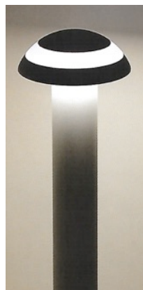
LWC 015-600 Ø135 x 600 LED 7W