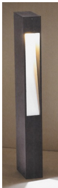
LWC 006-6001 100 x 50 x 600 COB 1 x 7W