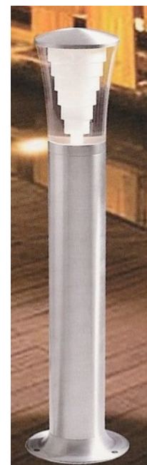
LWC 102-600 Ø100 x 600 COB 1 x 7W