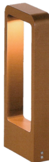
LWC 051-650 150 x 40 x 650 1 x COB 7W